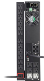
Side mounting Flex PDU with Tower UPS